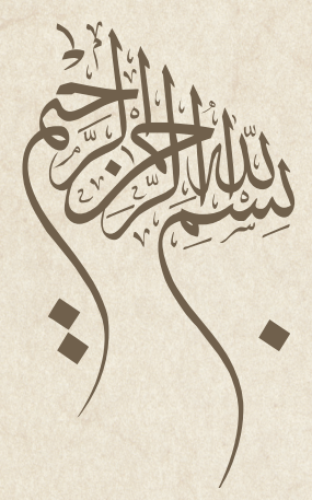
In the Name of Allah, the Beneficent, the Merciful.